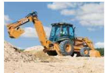
580 Super N WT