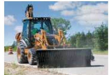
580 Super N