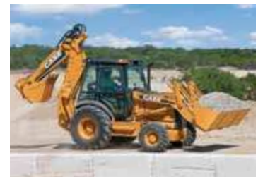
590 Super N