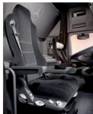
Seat coverings have also been updated, being smart, restful, durable and easy to clean