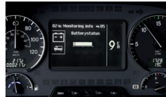
A new battery status display provides the driver with complete reassurance – a valuable comfort feature especially when operating in remote or cold environments