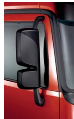
Improved exterior mirrors give a better than ever view down the sides of the vehicle. The standard finish for the covers is in black, with the option of painting into the chosen cab colour. Mirror assemblies for Executive specification trucks have a chrome finish