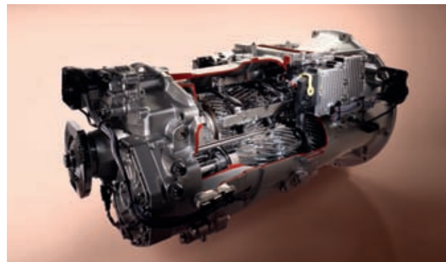
With 30% faster shifting and updated sensors, the new Mercedes PowerShift 2 automated gearbox provides quantifiable improvements in both economy and performance

reliability and durability are also maximised to the full. The new Actros' fuel economy is further enhanced by augmenting the cab's clean exterior lines with factory-fitted roof and side air deflectors (4 x 2 tractors having side skirts as well). By combining exceptional value at the time of purchase with even lower whole life operating costs, the new Actros takes both the productivity and operating efficiency of premium road transport another step into the future.