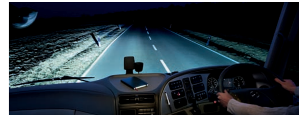
The new Actros' headlamps provide a significantly improved performance, both in range and spread. Full beam performance is particularly impressive, as is the automatic dip beam function that's ideal for quickly changing lighting situations such as driving through tunnels. And for the first time on a truck, Bi-Xenon lamps are also optionally available