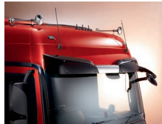
A new external sunvisor is available. Stylish and tough, the sunvisor could significantly reduce driver fatigue when travelling long distances