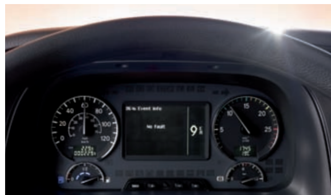
With new chrome instrument surrounds and revised numerals, the new Actros' instrumentation is clearer and classier than ever

mirrors deliver improved visibility and operating safety. Drivers of the new Actros will also appreciate a more direct steering system for enhanced handling and braking. The new, brighter headlamps play their part too, as does the automatic activation of the wipers. Providing a truly relaxed, effortless performance for driver and operator alike, the new Actros more than delivers on all its promises.