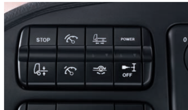
A wide range of individually selectable gearbox modes including Power Mode, EcoRoll, Extended Cruise Control and Manoeuvring Mode allows Actros drivers to get the very best from their trucks in every type of operating situation