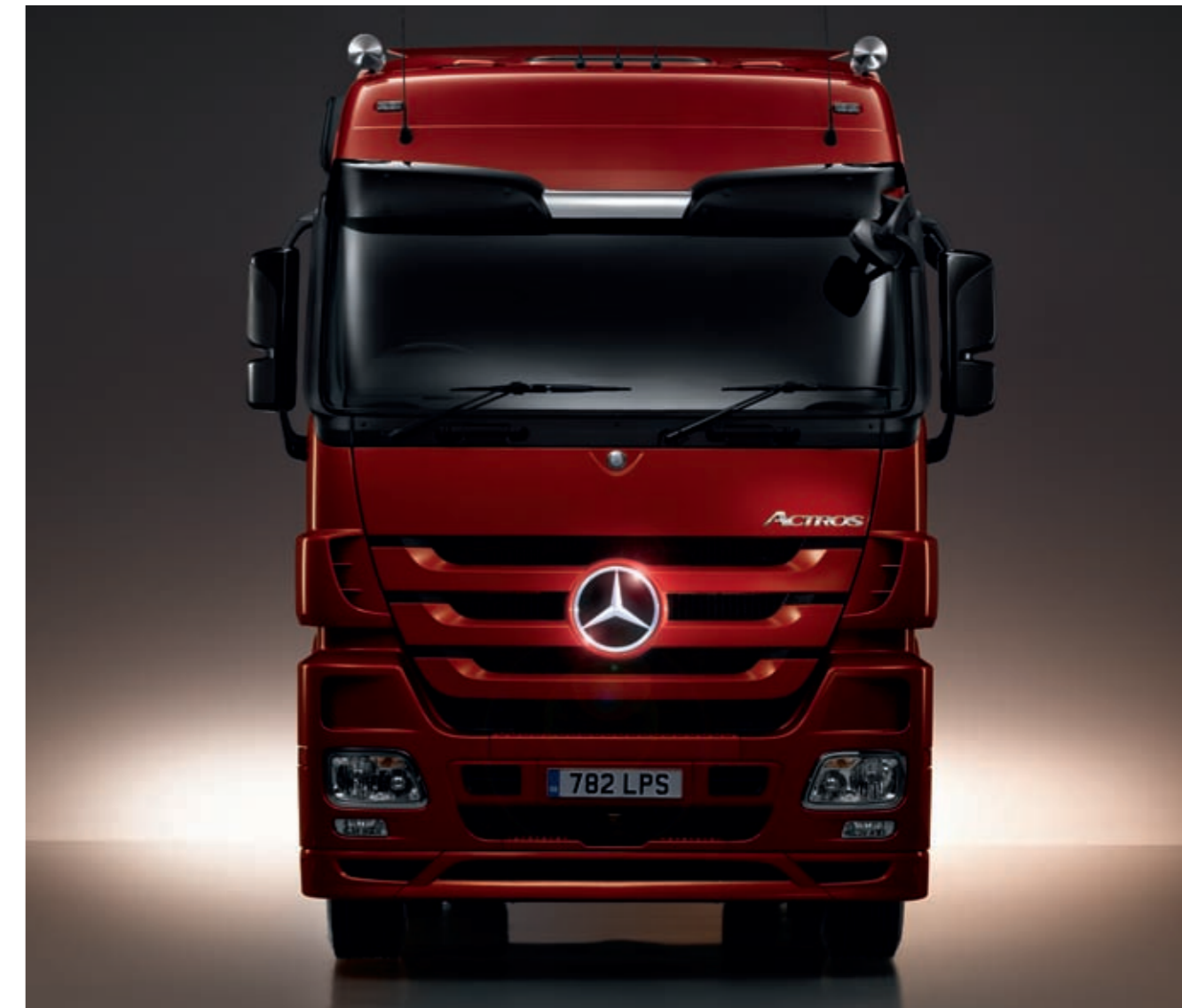
Dramatic, elegant and distinctive. An illuminated back-lit star is also available for the new Actros. The final, individual badge of quality for Europe's premium heavy truck