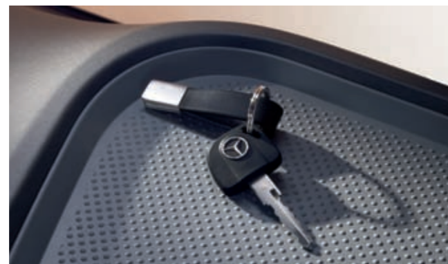
A token of real exclusivity, even the new Actros' ignition key has been re-designed to include a chrome-plated Mercedes-Benz star!