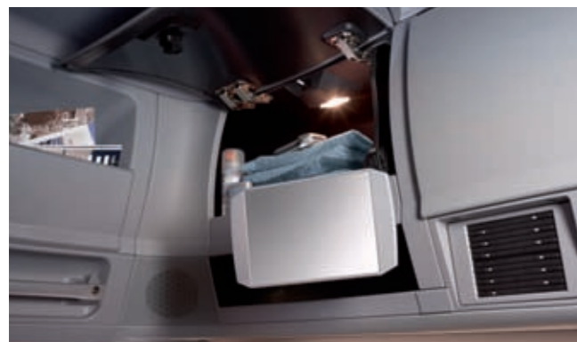
An adjustable shaving mirror is provided in the storage compartment above the windscreen

passenger (optional) doors, along with the further option of an electrically operated version for the windscreen. Other everyday comfort features include relaxed ambient lighting, a hi-fi quality cd and loudspeaker system, a shaving mirror and a towel rail. And to help clean out the cab after many days away, there's also an air connection point under the driver's seat (for use with the optional compressed air gun).