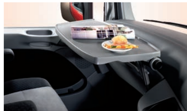
A detachable, folding passenger side table is also available as an option