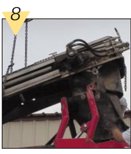
Raise the feeder until the transfer skirts clear the swivel ring.

Remove the two 1" - 81/2" bolts located on each side of the swivel transfer indicated by the arrow. It is not necessary to disconnect the feeder hydraulic hoses when the feeder is positioned in this manner.