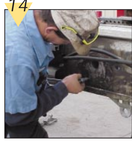
Keep clear of the underside of the belt in case the pulley drops out when the bolts are removed.

Remove the four flat head hex socket bolts from the right-side bearing box. If you haven't already done so, remove the four hex head bolts from the left-side bearing box. If the pulley does not drop free, spread the rails slightly with a tensioning jack.