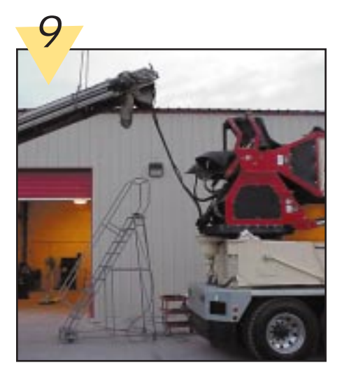
Keep the feeder hoses away from projections and pull the truck ahead enough for clearance. Set the parking brake and re-engage the right-hand PTO.