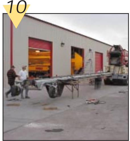
Lower the feeder to suitable work stands (horses) in order to remove the pulley and feeder belt. Operating the hinges and dolly can make setting the feeder in place much easier. When the feeder hinges are straight, shut off the truck engine and remove the keys.