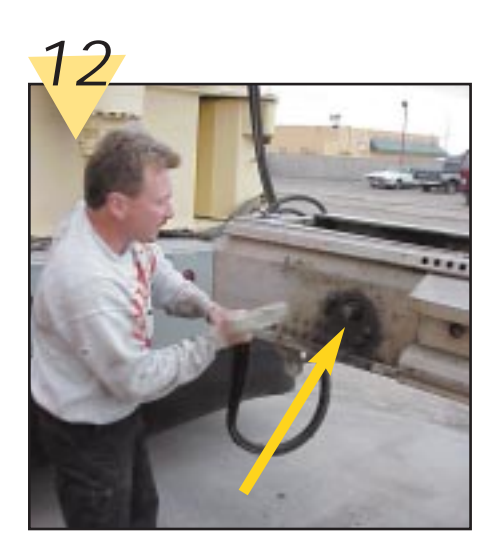
Refer to the Telebelt Manual Maintenance Section 6.11 for the complete procedure for removing and installing the feeder collet.

Loosen the collet retainer bolt (arrow) and strike with a hammer to drive the collet out of its seat.