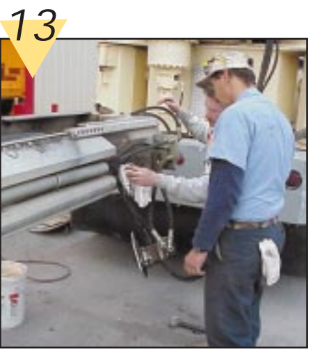
Remove the feeder drive motor from the collet and let it hang by the hoses. Remove the collet and clean the collet bore. Inspect the collet splines, drive motor splines, collet key and collet keyway for wear. Replace worn parts upon reassembly.

Note the four hex head bolts near the arrow. They hold the left-side bearing box and can be removed after the collet and collet retainer bolt have been removed.