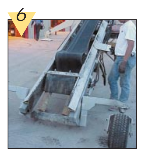
Slowly retract the dolly. This will push the tail pulley frame into the side rails. Do not push the frame so contact is made with the first u-roller. When the frame is positioned as shown, there is plenty of room to remove the tail pulley.

Do not let the 4 x 4 boards push against the top or bottom tie strips or the tie strips might be stripped out of the slide plates.