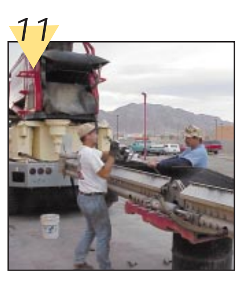
Remove the u-rollers, upper side idler rollers, discharge boot and head scraper assembly. It is not necessary to remove the bottom rollers.