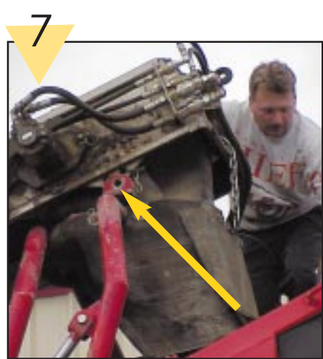
Attach a suitable lifting device to the top section of the feeder.

Remove the two 1" - 81/2" bolts located on each side of the swivel transfer indicated by the arrow. It is not necessary to disconnect the feeder hydraulic hoses when the feeder is positioned in this manner.