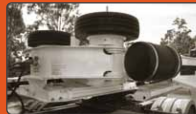
STANDARD SPARE TYRE ARRANGEMENT