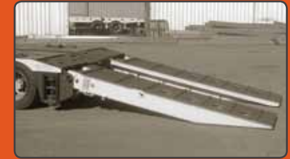
REAR RAMP LOWERED POSITION