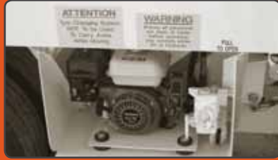
5.5HP PULL-START HYDRAULIC POWER PACK