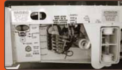
HYDRAULIC CONTROLS AND LOCKING PINS