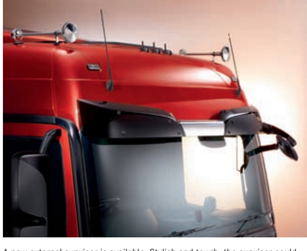
A new external sunvisor is available. Stylish and tough, the sunvisor could significantly reduce driver fatigue when travelling long distances