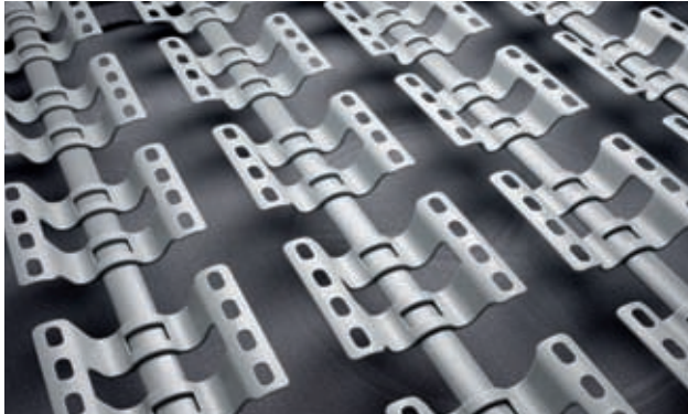
Mattresses are supported by a system of adjustable sprung slats