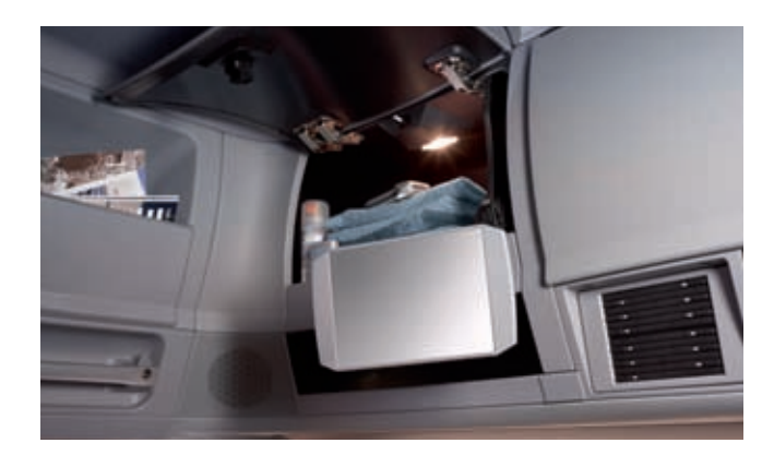
An adjustable shaving mirror is provided in the storage compartment above the windscreen

passenger (optional) doors, along with the further option of an electrically operated version for the windscreen. Other everyday comfort features include relaxed ambient lighting, a hi-fi quality cd and loudspeaker system, a shaving mirror and a towel rail. And to help clean out the cab after many days away, there's also an air connection point under the driver's seat (for use with the optional compressed air gun).