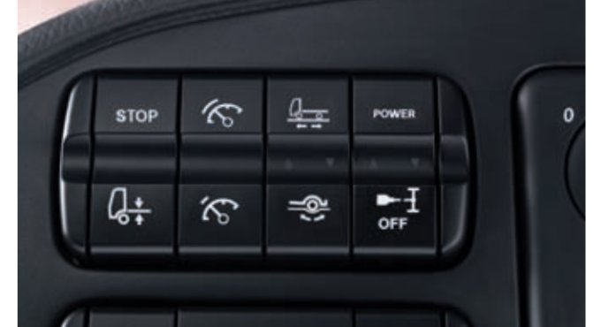
A wide range of individually selectable gearbox modes including Power Mode, EcoRoll, Extended Cruise Control and Manoeuvring Mode allows Actros drivers to get the very best from their trucks in every type of operating situation