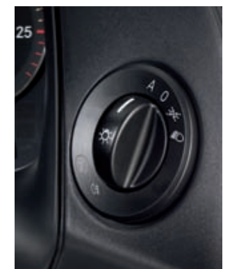
A rain and light sensor is part of the standard specification. Headlights can be automatically activated to dipped beam operation, and wipers activated when rain begins to fall