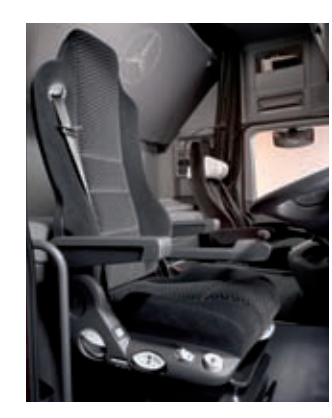
Seat coverings have also been updated, being smart, restful, durable and easy to clean