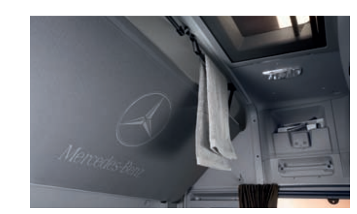
Both High Roof Sleeper and MegaSpace cabs feature a purpose-designed towel rail, which is also useful for drying wet clothes