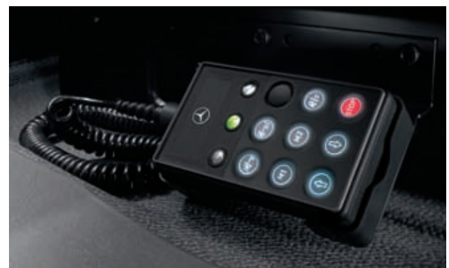
The service panel display is now illuminated for easy reading by night and day

The new Actros High Roof Sleeper and MegaSpace cabs are offered with a full range of sunblinds. Standard equipment includes the sunblind for the driver's door window as well as a manual sunblind for the windscreen (electric version optional). A sunblind for the passenger door window is also available