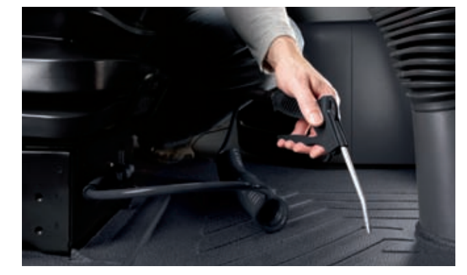
A compressed air connection is located under the driver's seat. Designed for use with the optional air gun, cleaning difficult areas of the cab is fast and easy