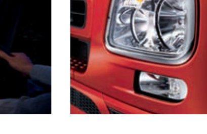
The new Actros' headlamps provide a significantly improved performance, both in range and spread. Full beam performance is particularly impressive, as is the automatic dip beam function that's ideal for quickly changing lighting situations such as driving through tunnels. And for the first time on a truck, Bi-Xenon lamps are also optionally available