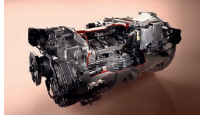
With 30 % faster shifting and updated sensors, the new Mercedes PowerShift 2 automated gearbox provides quantifiable improvements in both economy and performance

reliability and durability are also maximised to the full. The new Actros' fuel economy is further enhanced by augmenting the cab's clean exterior lines with factory-fitted roof and side air deflectors (4 x 2 tractors having side skirts as well). By combining exceptional value at the time of purchase with even lower whole life operating costs, the new Actros takes both the productivity and operating efficiency of premium road transport another step into the future.