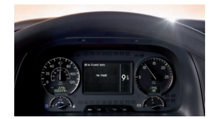
With new chrome instrument surrounds and revised numerals, the new Actros' instrumentation is clearer and classier than ever

mirrors deliver improved visibility and operating safety. Drivers of the new Actros will also appreciate a more direct steering system for enhanced handling and braking. The new, brighter headlamps play their part too, as does the automatic activation of the wipers. Providing a truly relaxed, effortless performance for driver and operator alike, the new Actros more than delivers on all its promises.