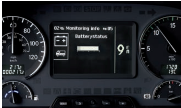
A new battery status display provides the driver with complete reassurance – a valuable comfort feature especially when operating in remote or cold environments