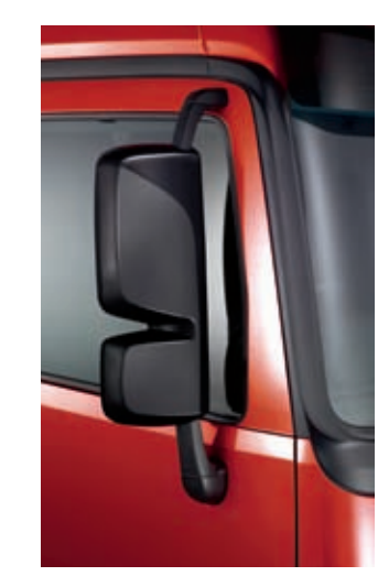
Improved exterior mirrors give a better than ever view down the sides of the vehicle. The standard finish for the covers is in black, with the option of painting into the chosen cab colour. Mirror assemblies for Executive specification trucks have a chrome finish