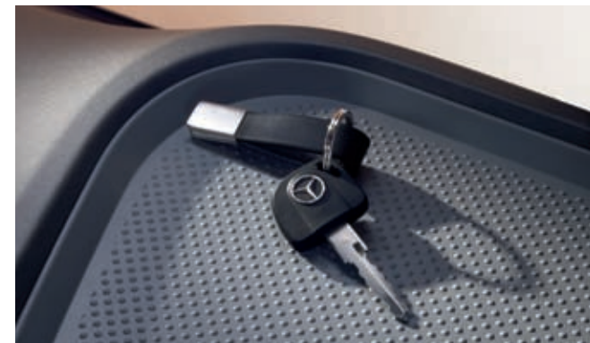
A token of real exclusivity, even the new Actros' ignition key has been re-designed to include a chrome-plated Mercedes-Benz star!