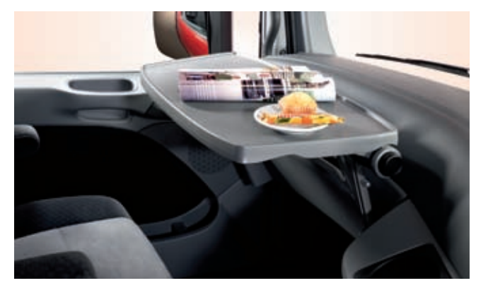
A detachable, folding passenger side table is also available as an option