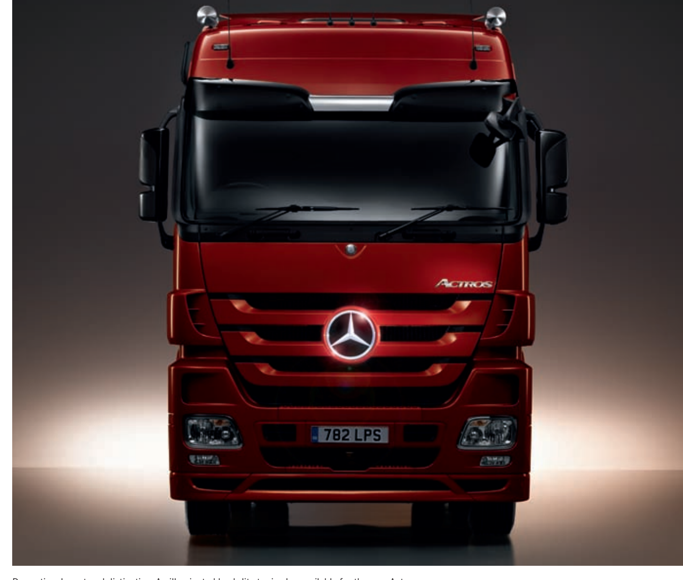
Dramatic, elegant and distinctive. An illuminated back-lit star is also available for the new Actros. The final, individual badge of quality for Europe's premium heavy truck