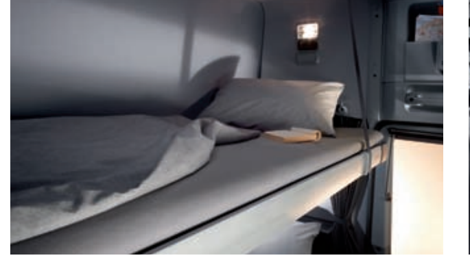
In addition to the bed in the lower position, a higher bed is also fitted as standard to all High Roof Sleeper and MegaSpace cabs