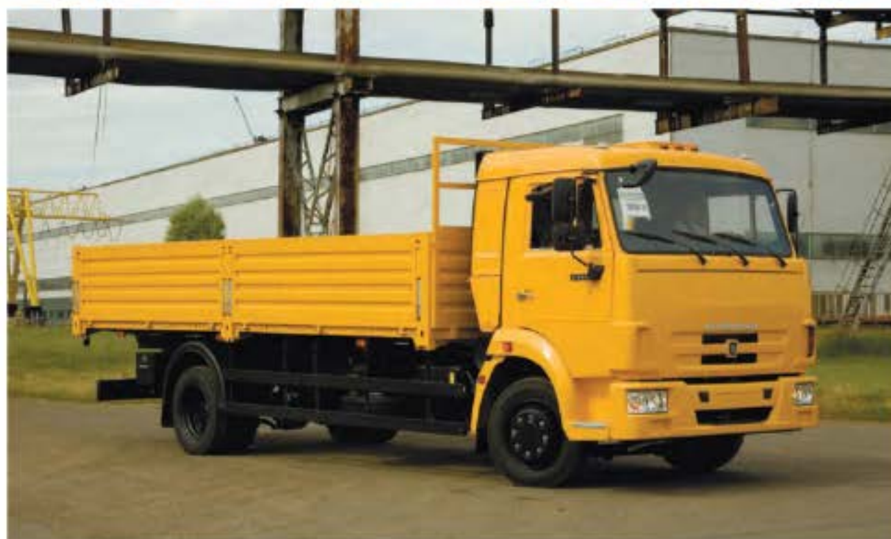
2-axle drop-side vehicle