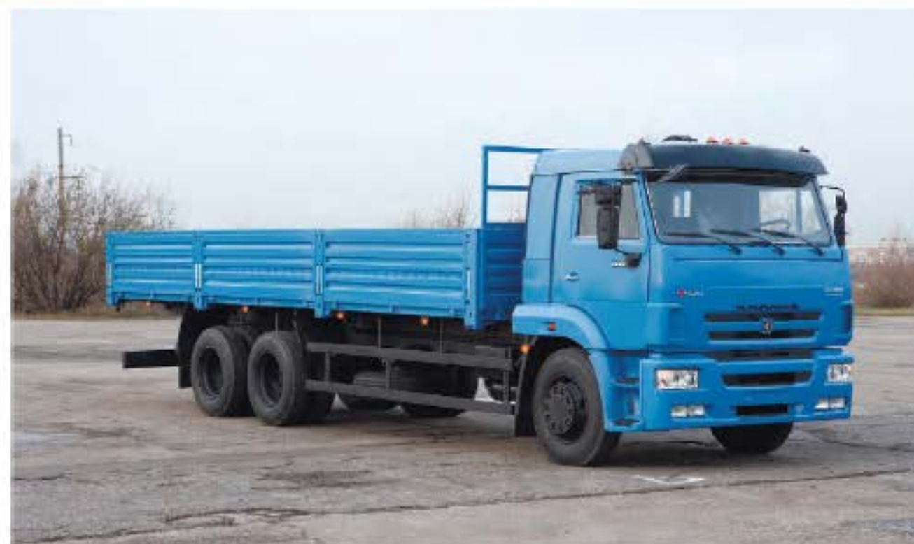
3-axle drop-side vehicle