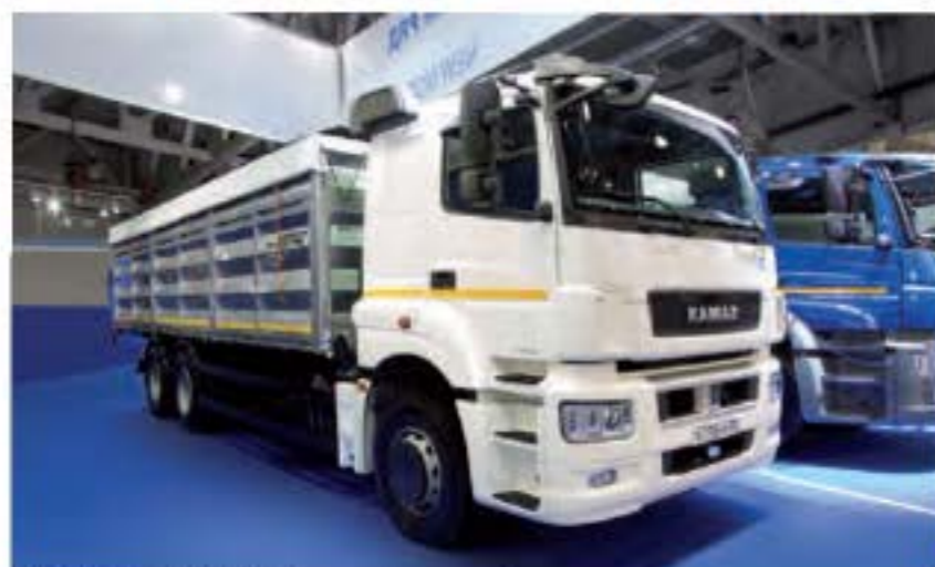
KAMAZ-65207 grain carrier