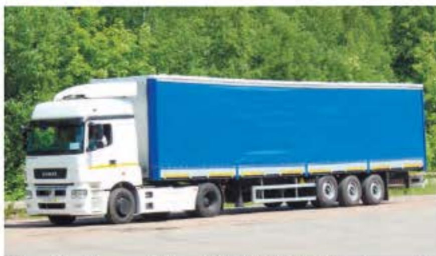
Combination vehicle: KAMAZ-5490 tractor unit with a drop-side semi-trailer