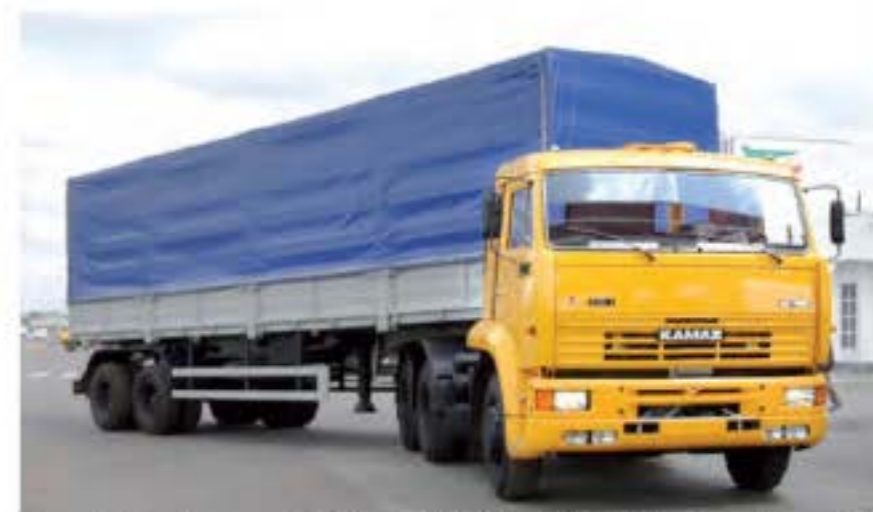
Combination vehicle: KAMAZ-65116 tractor unit with drop-side semi-trailer