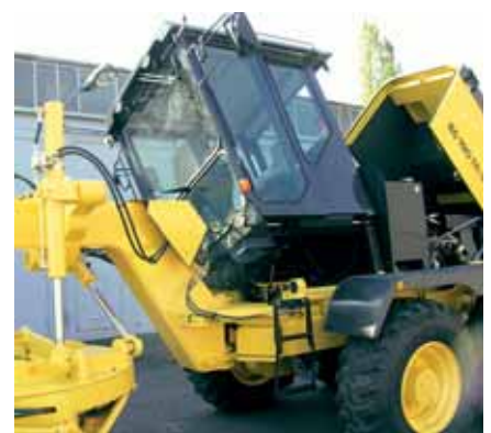
Good maintenance accessibility: Cab and engine cover tiltable.