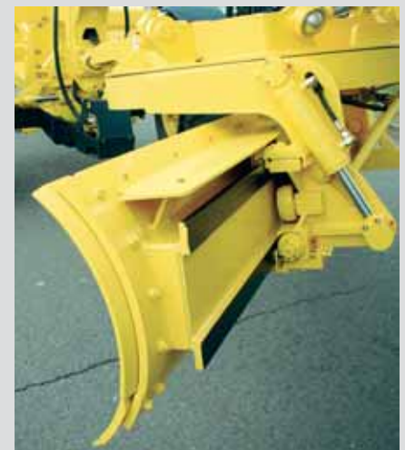
Infinitely adjustable hydraulic cutting angle adjustment.