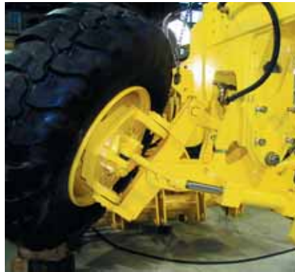
Driven front axle with wheel lean.