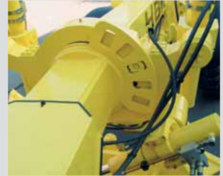
Adjustment yoke for ground clearing and excavation work.