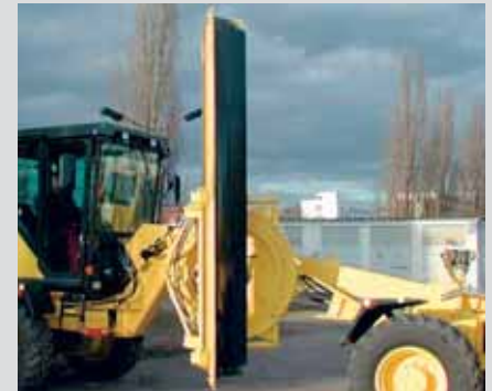
Turntable optionally available with sliding shoe elements or roller bearings. Ground clearing angle 90° to the right and left.