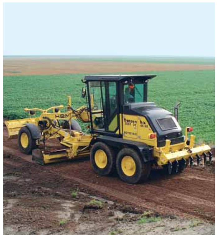
BG 110 TA, the compact tandem grader, ideal for small and medium building sites

With six weight classes and a choice between tandem and all-wheel drive for the most grader types HBM has all versions to provide the right grader for every purpose. The compact BG 90 and BG 110 units are ideal for the confined inner-city site, cycle tracks and sports facilities; the medium duty three-axle versions, the BG 130 and BG 160 are the universal choice for road building, the large three-axle BG 190 and BG 240 are the powerhouses for handling heavy duty applications, such as airfield and motorway construction, open pit mining and forestry operation. An extensive range of accessories and additional fittings also means that special individual requirements can also be handled with the best possible results.