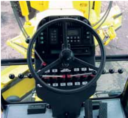
Good view to all sides with adjustable Euro control panel, NAIS control panel available.