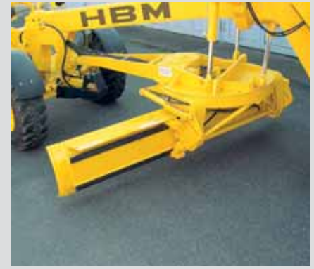
Sophisticated drive chain for rapid adjustment of the desired blade position.

Articulated joint with +/- 30° articulation