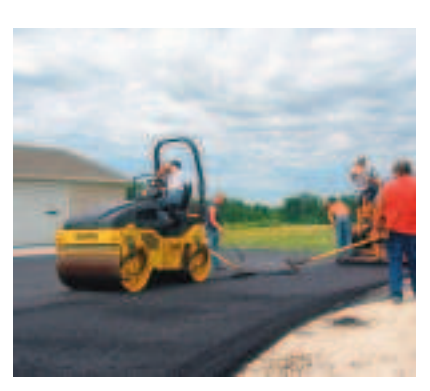
BW120AD-4 shown with optional folding ROPS.