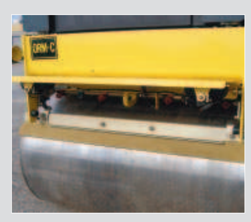
Wind protected, quick-disconnect spray nozzles with dual scrapers per drum.