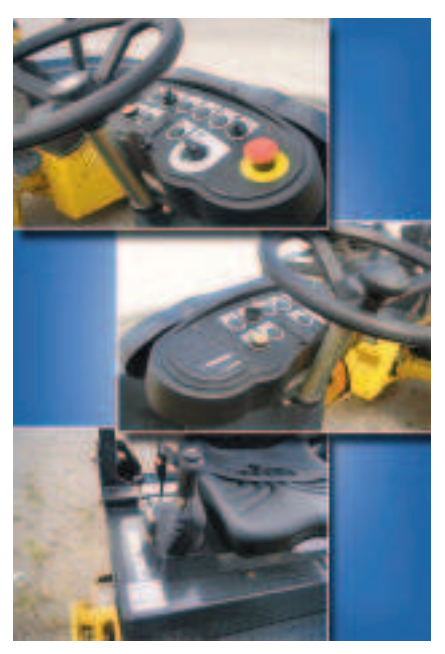
Ergonomically engineered operator's platform providing optimum comfort and maximum productivity.