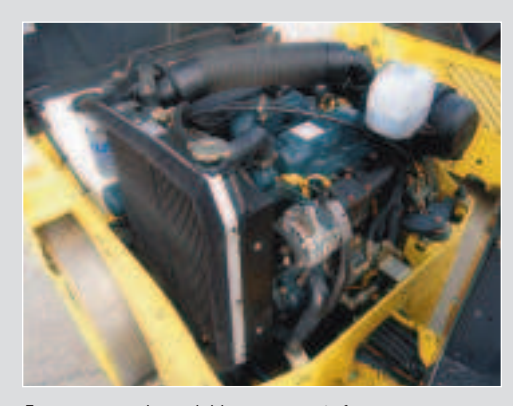
Easy access engine and drive components for simplified servicing

With these features and many more, it's easy to see why this model maintains a high residual value while delivering lower lifetime operating costs.