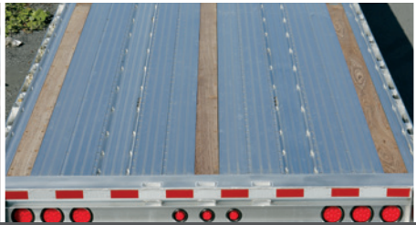
Aluminum structural floor with wood nailers