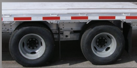
Steel Wheels (Standard)