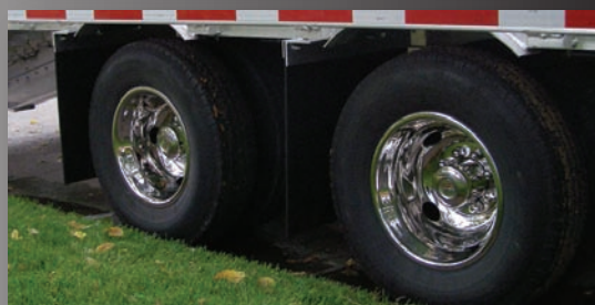
Stainless Steel Wheel Liners