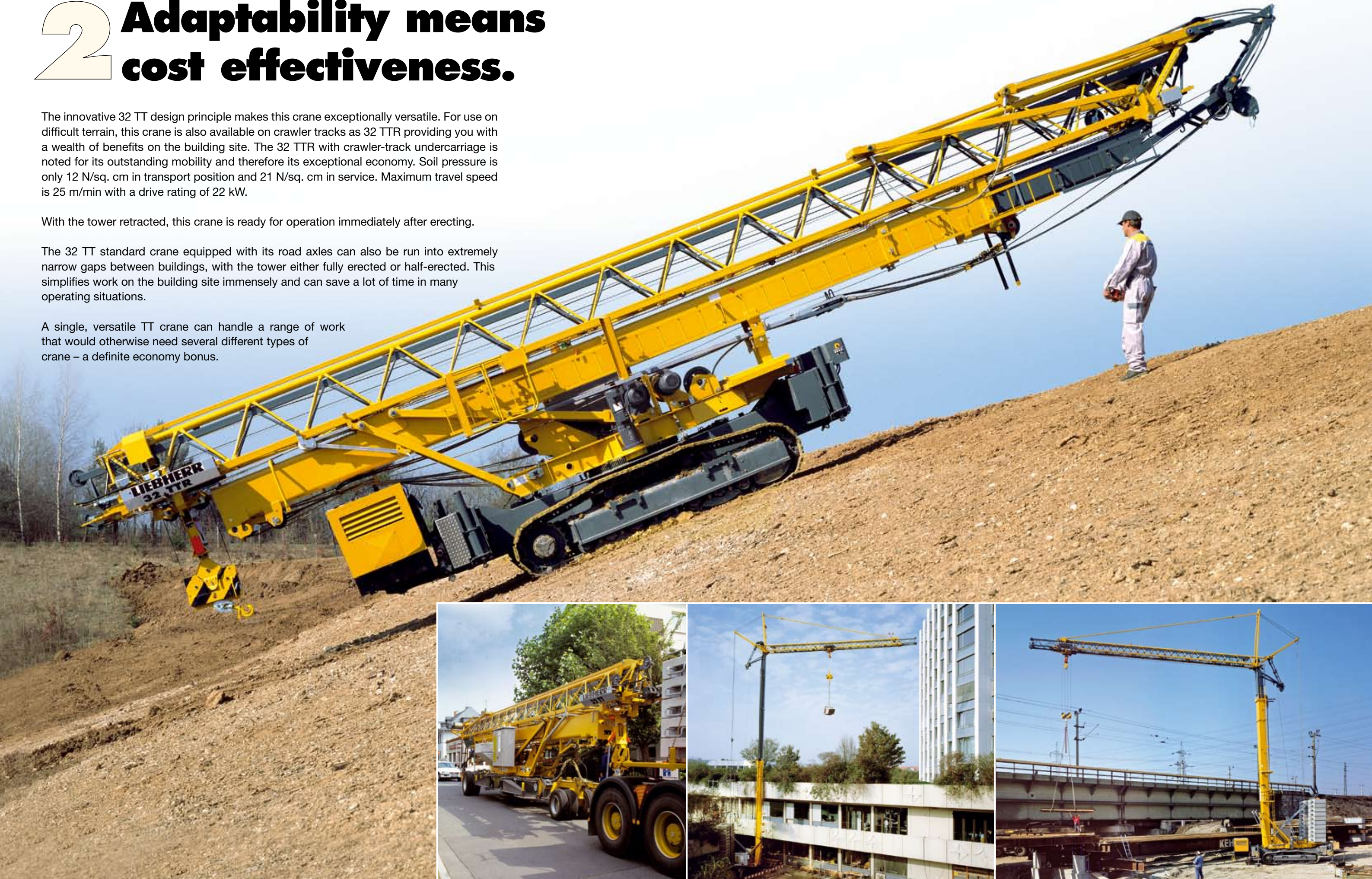
Compact design, quick and easy movement.

A single, versatile TT crane can handle a range of work that would otherwise need several different types of crane – a definite economy bonus.