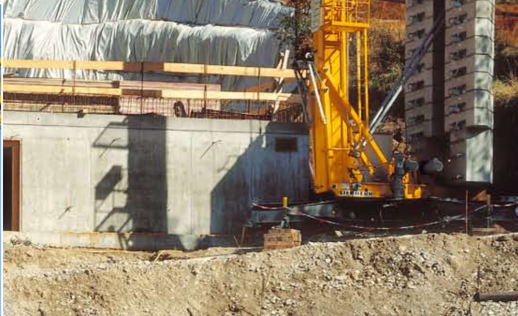
Hoisting and erecting winches.