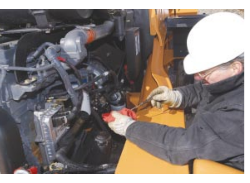
Ground-level fluid checks make daily maintenance quick and easy.

Keeping D Series wheel loaders in top running shape requires less effort, so you have more time for the really important things — like work.