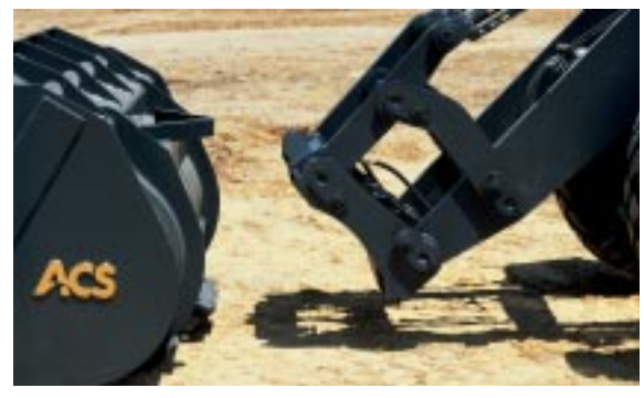
Hydraulic Quick Coupler — For quick and easy attachment changes, the optional hydraulic quick coupler saves time and boosts productivity.

A wide array of attachments enhance the versatility of the machine and make it adjustable to a variety of load-and-carry applications.