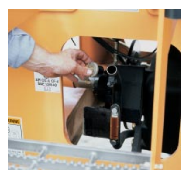
No tools are needed for daily checks.